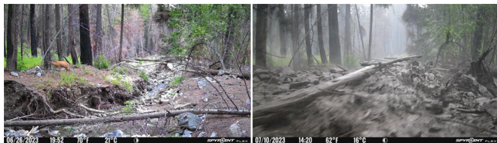
The images above, captured by a DNR motion-activated camera, show a before-and-during view of a damaging debris flow from the 2021 Cedar Creek burn area.

Severe wildfires cause significant damage to landscapes, people, and infrastructure, leaving communities vulnerable to hazards like burned debris, landslides and flooding (Figure 1). The problem is exacerbated by climate change, lack of coordinated information sharing about the post-fire hazards, insufficient funding, and often lack local capacity to plan for and mitigate hazards created by severe fire.