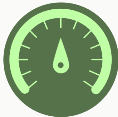
Amount of thinning