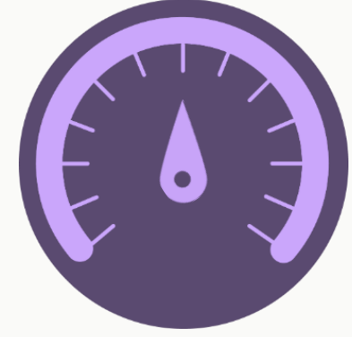
Emphasis on silviculture