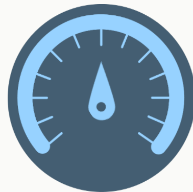
Deferral of structurally complex, carbon-dense forest