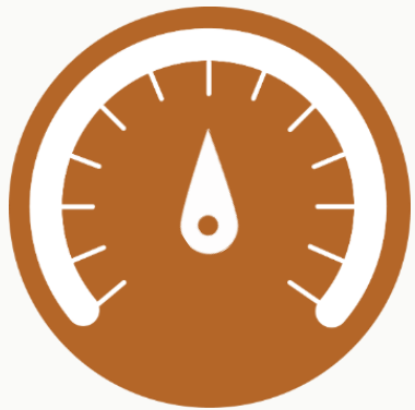
Harvest rotation length

Scenarios were developed by turning “dials.” The silviculture dial was added later in the process.