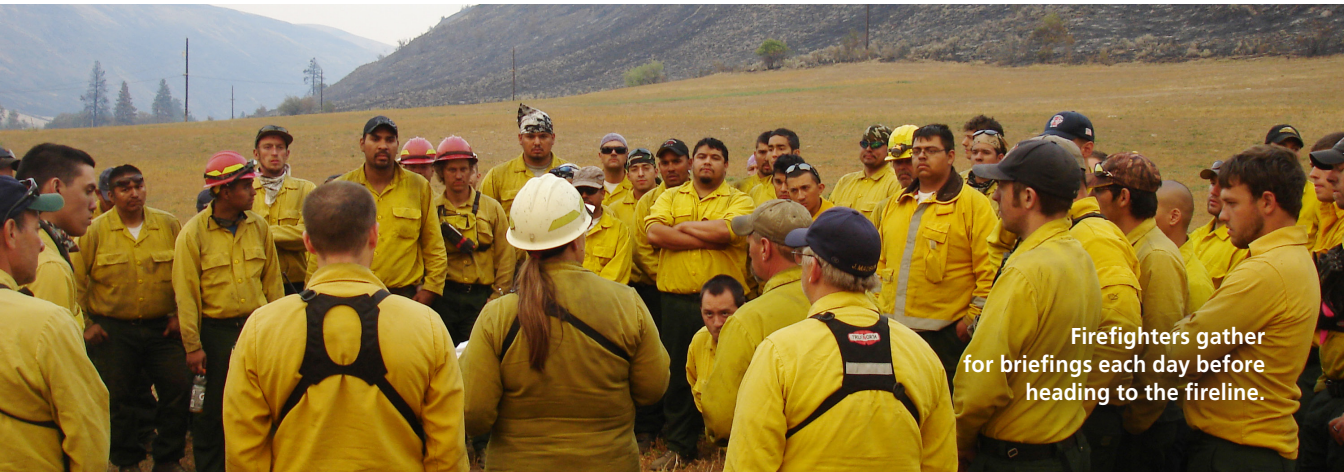
Firefighters gather for briefings each day before heading to the fireline.

Learn more online about DNR Wildfire Assessments