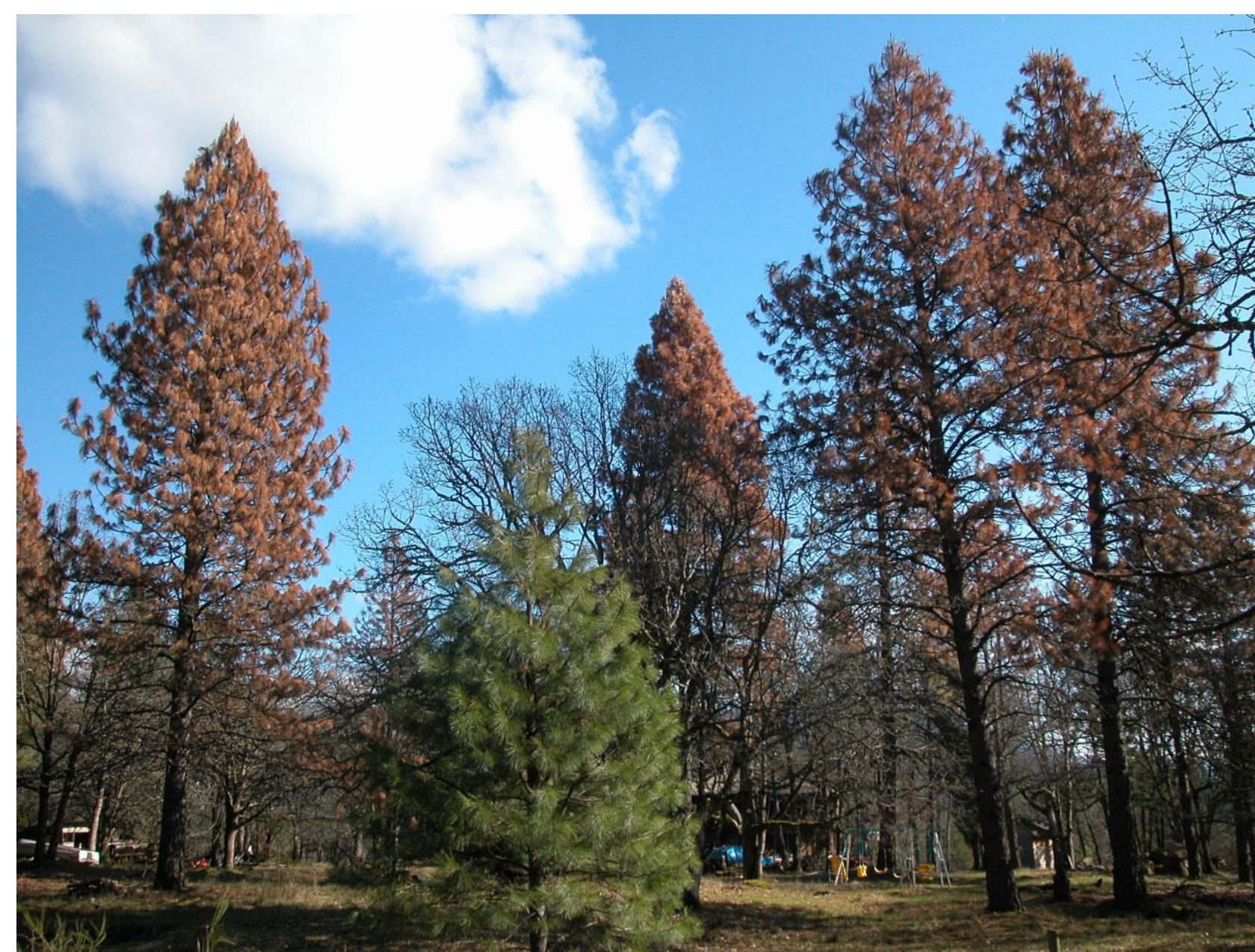
Figure 1. Mature ponderosa pines killed by CFI in a residential area of Underwood, Washington.