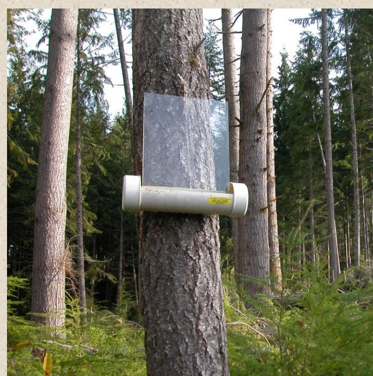
Figure 4. Passive flight intercept trap.