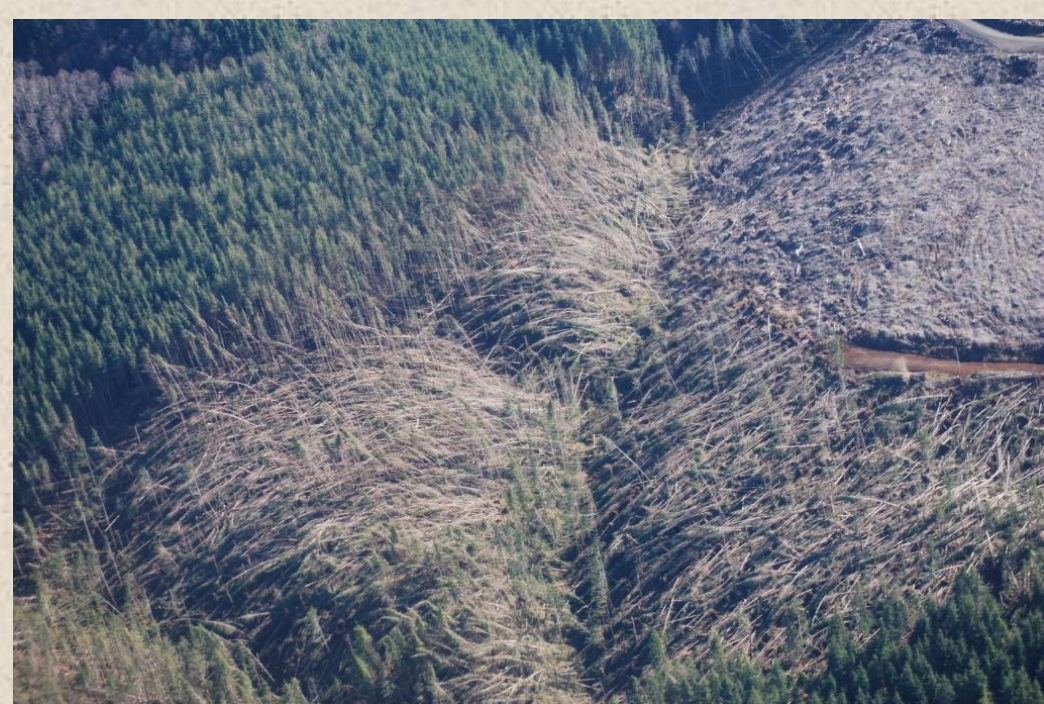
Figure 1. Severe windthrow at the edge of a harvested area.