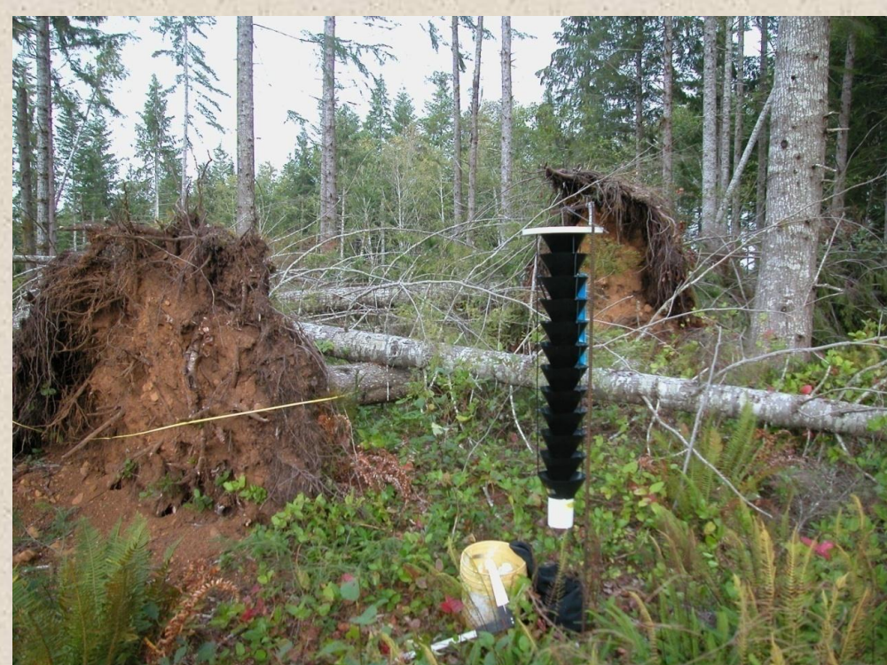
Figure 3. Ethanol and alpha-pinene baited funnel trap.