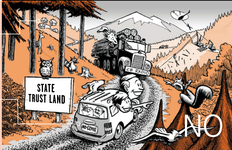
ILLUSTRATIONS BY KEN FINCH

Property owners need to find alternate routes, acquire legal access, or petition the county to convert the trust road to a county road.