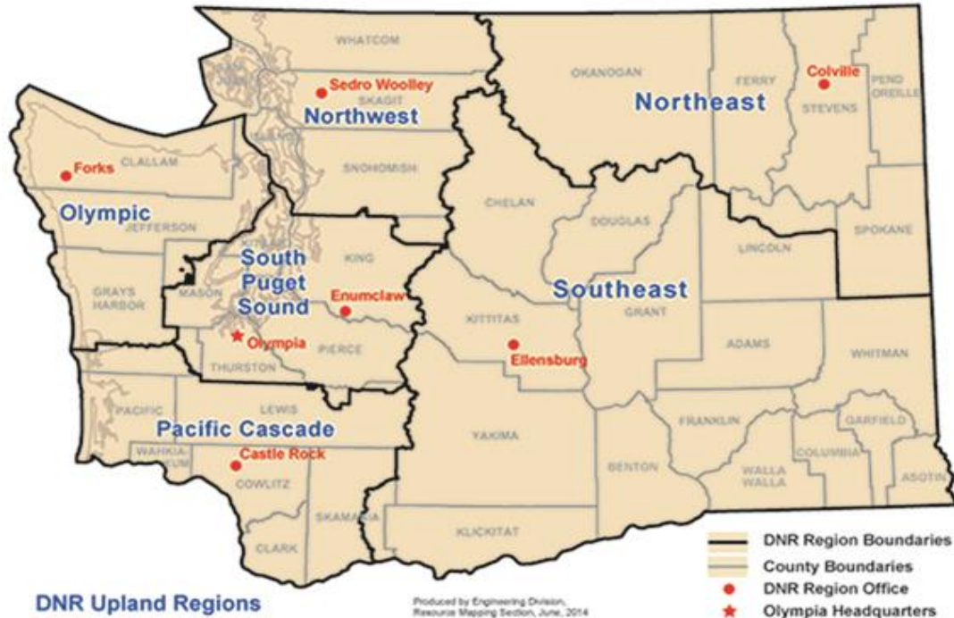
Map of DNR Regions and Offices