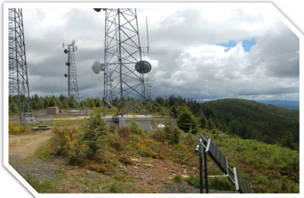
Naselle Ridge, Pacific Cascade Region