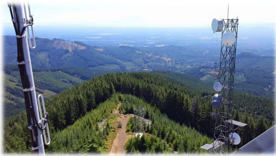
Capitol Peak, South Puget Sound Region