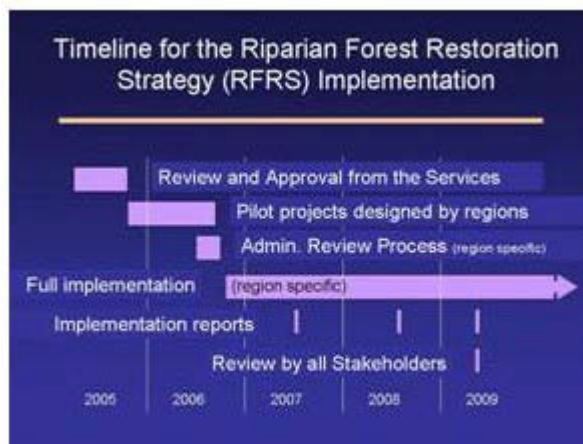
RFRS Implementation timeline.

Providing the information needed to implement our Habitat Conservation Plan is an enormous challenge. Many of the silvicultural systems and forest practices needed to meet this challenge are untested or have yet to be developed. Developing innovative forest management methods capable of achieving the economic and ecological objectives of the Habitat Conservation Plan will require the sound application of silvicultural and ecological knowledge, creativity, and reliable information. Reliable information can only be obtained through well-planned and well-executed monitoring and research combined with effective dissemination of information.