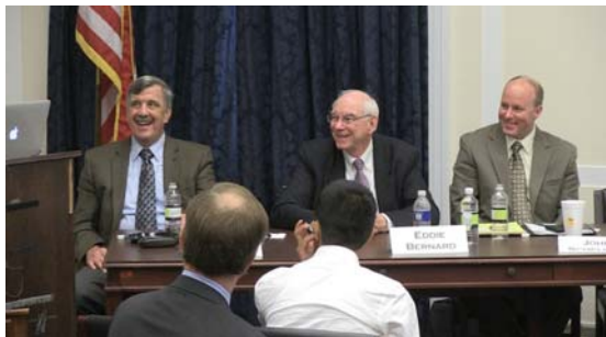
Scientists discuss lessons learned from the March 11, 2011 tsunami in Japan at a congressional briefing sponsored by the American Geophysical Union.

“There is no one flyer, no one commercial that’s going to reach all of these audiences,” he said. “They all have to be engaged individually, and they have to be approached with something that shows what’s in it for them.”