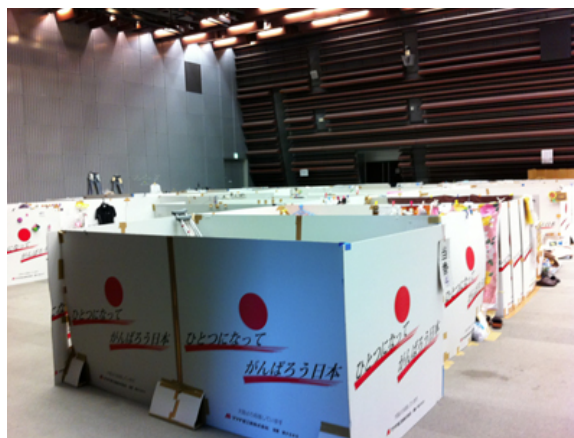
Some Japanese evacuees living in shelters after the 2011 disaster resorted to cardboard boxes for a little privacy. ♦

“We must not only honor the memory of those who lost their lives, but we must also help rebuild the lives of those who are still suffering.”