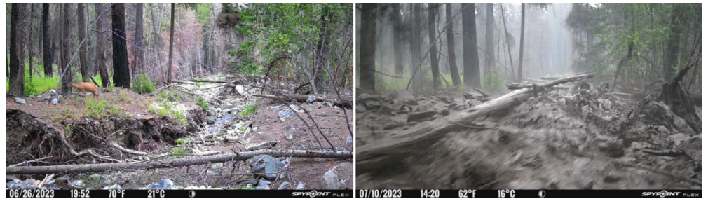
The images above, captured by a DNR motion-activated camera, show a drainage within the 2022 Cedar Creek burn area before and during a recent debris flow. This debris flow, and two previous debris flows, impacted several homes and roads in a small community.

For years following a wildfire, even modest rainstorms can produce unusually high runoff that turns into flash floods and (or) debris flows. Debris flows can travel a considerable distance, disrupting roadways and other infrastructure lifelines, destroying private property, and causing flooding. Due to their speed and magnitude, debris flows pose an immediate, critical threat to public safety.