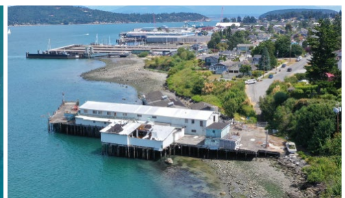
Triton-America Pier, Anacortes