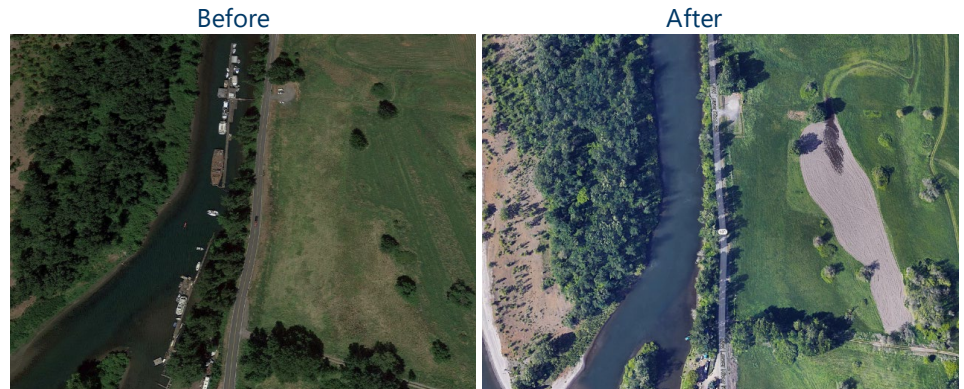
Finished Project: Fisherman’s Slough, Columbia River

Aquatic Derelict Structures , including derelict pilings, over-water and submerged structures, such as tire piles (“reefs”), are an eye-sore and harm the environment by reducing water quality, diminishing habitat quality, creating safety hazards . NOAA issued a biological opinion that found nearshore structures threaten salmon because they negatively impact nearshore habitat. Removal and restoration of aquatic derelict structures will protect our waterways and improve fish habitat.