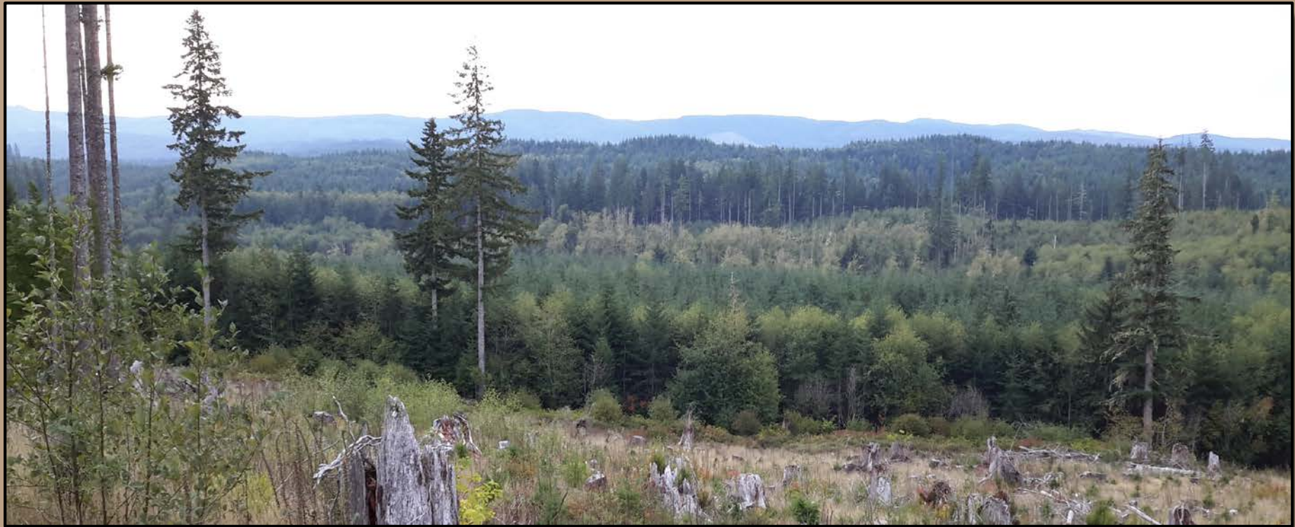
Douglas Fir marking the North line of the SW parcel