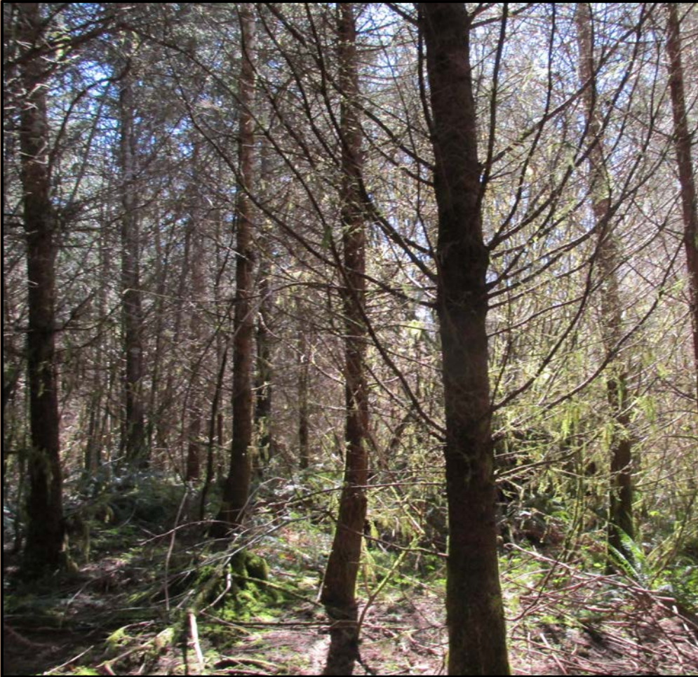
Interior Douglas Fir stand, NW parcel