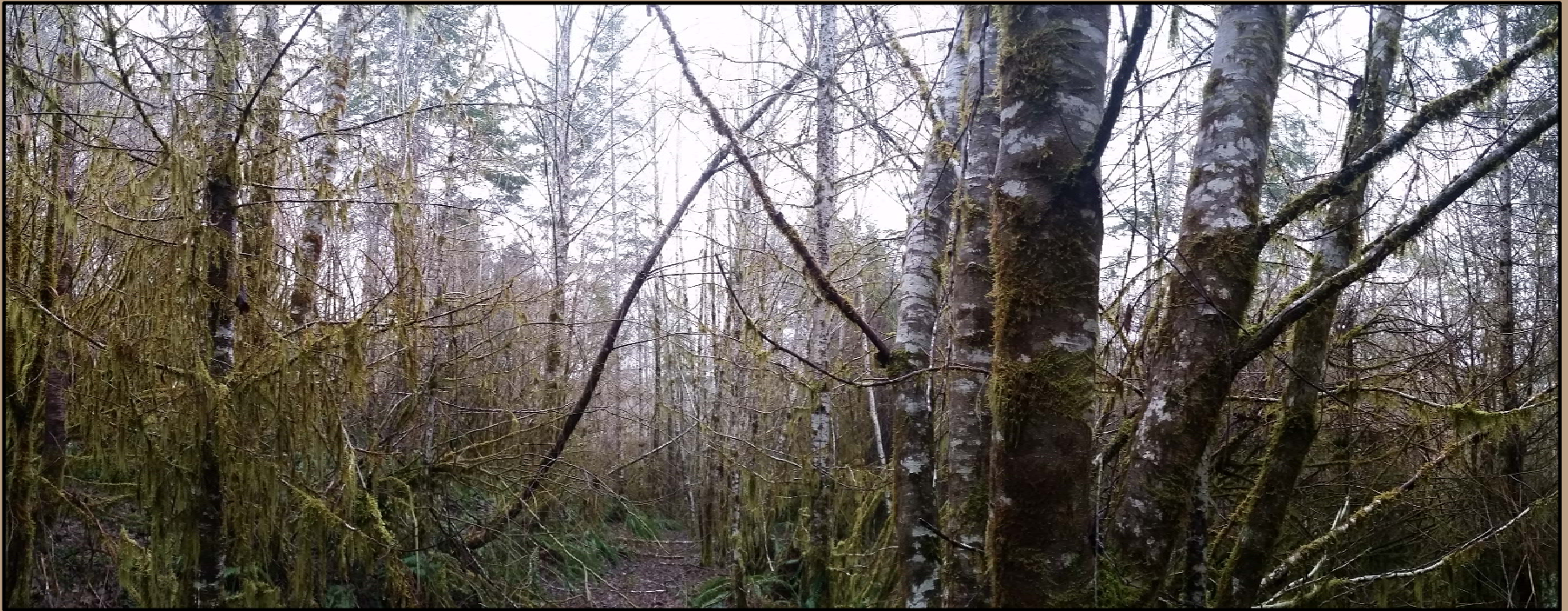
SW extent showing mixed hardwoods and Conifer, with DF in background.