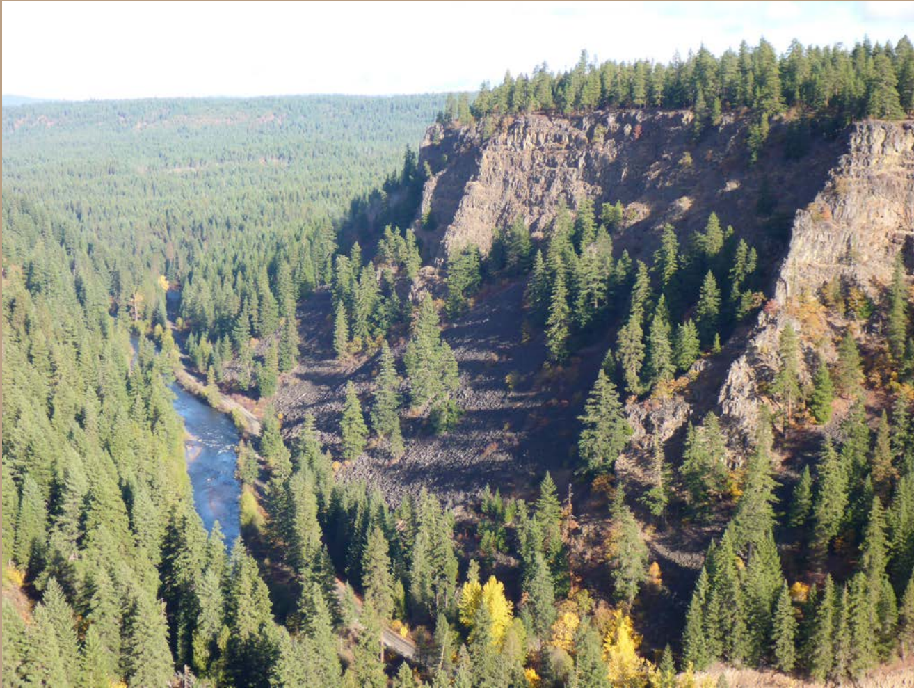
Klickitat River