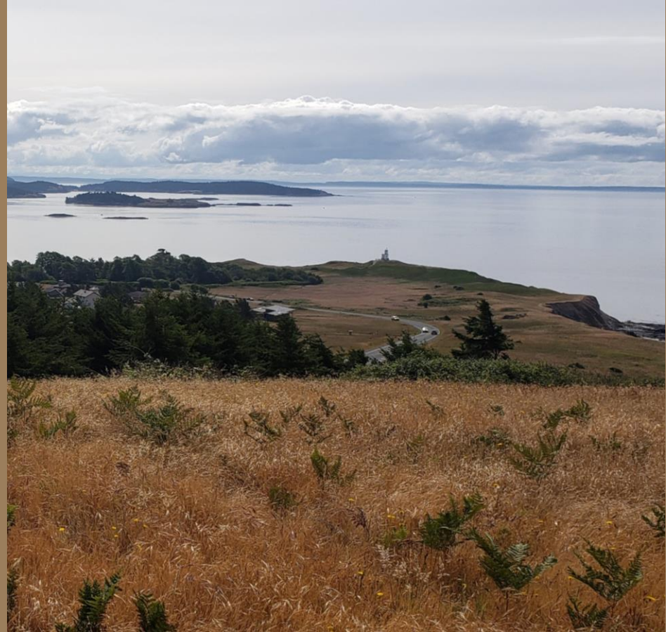
Cattle Point NRCA, also known as Xwho'shining