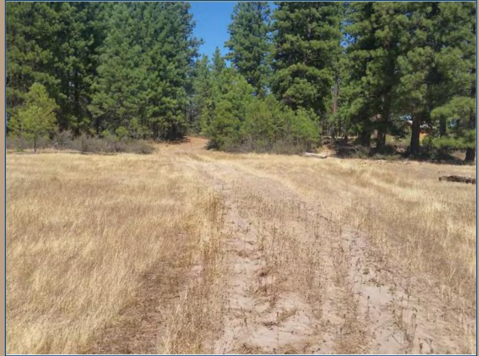
The Dalles to Ft. Simcoe historic Road