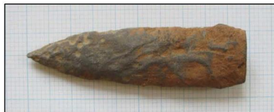
Projectile point - shows signs of flaking as well as grinding / pecking / polishing to create shape