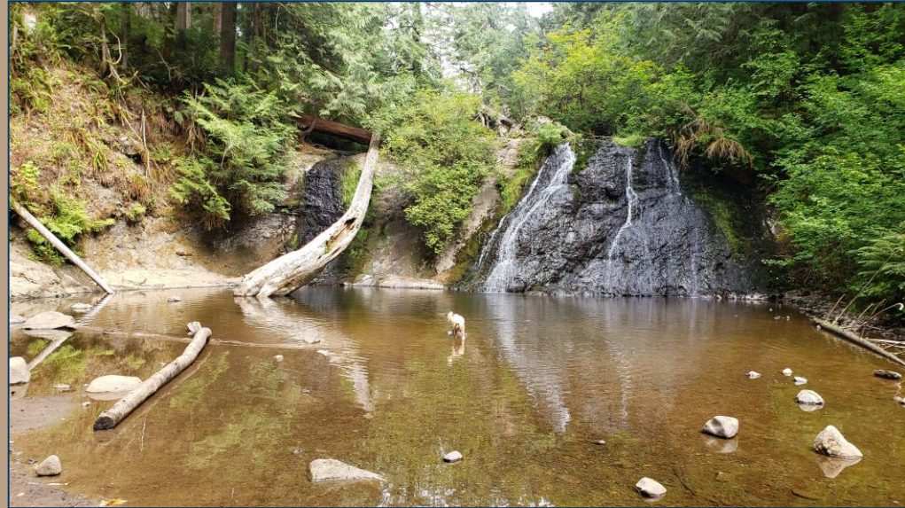
Native campsite with fish spawning pool and falls