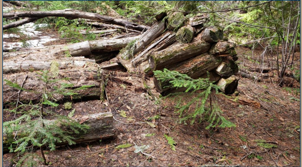
Remnant historic cabin (NE Region)