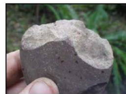
Ground stone chopper – edge is flaked and shows wear from use