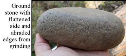
Ground stone with flattened side and abraded edges from grinding