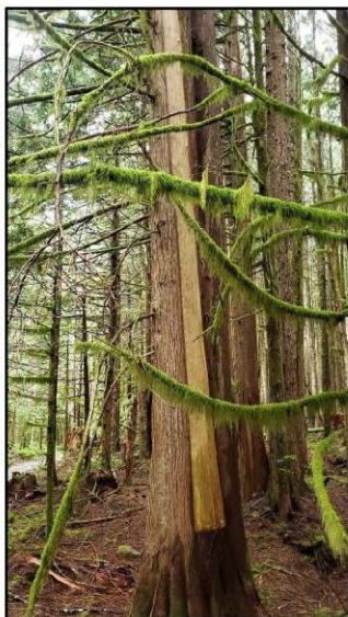
Recent Bark Stripping