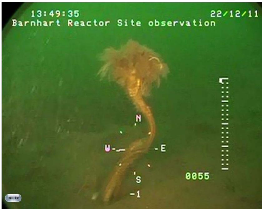
Figure 6. Anthropogenic Debris with Encrusting Fauna

In addition, it appeared that the seafloor had been previously disturbed because of the presence of holes, ridges, and furrows in the mud that had been colonized by burrowing anemones (Figure 4) and other fauna (see videography from time 13:34:18 through 13:47:30 on Global 2011). Older anthropogenic debris supported encrusting fauna (Figure 6) was also found during the ROV survey (Figure 6).