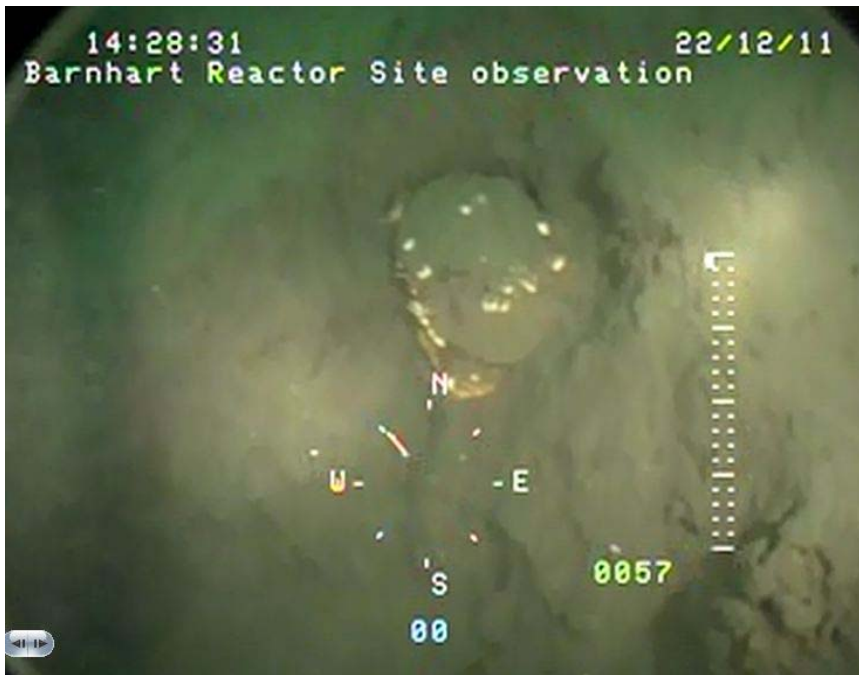
Figure 5. Live Dungeness Crab in the Reactor Vessel Impact Hole

In addition, it appeared that the seafloor had been previously disturbed because of the presence of holes, ridges, and furrows in the mud that had been colonized by burrowing anemones (Figure 4) and other fauna (see videography from time 13:34:18 through 13:47:30 on Global 2011). Older anthropogenic debris supported encrusting fauna (Figure 6) was also found during the ROV survey (Figure 6).