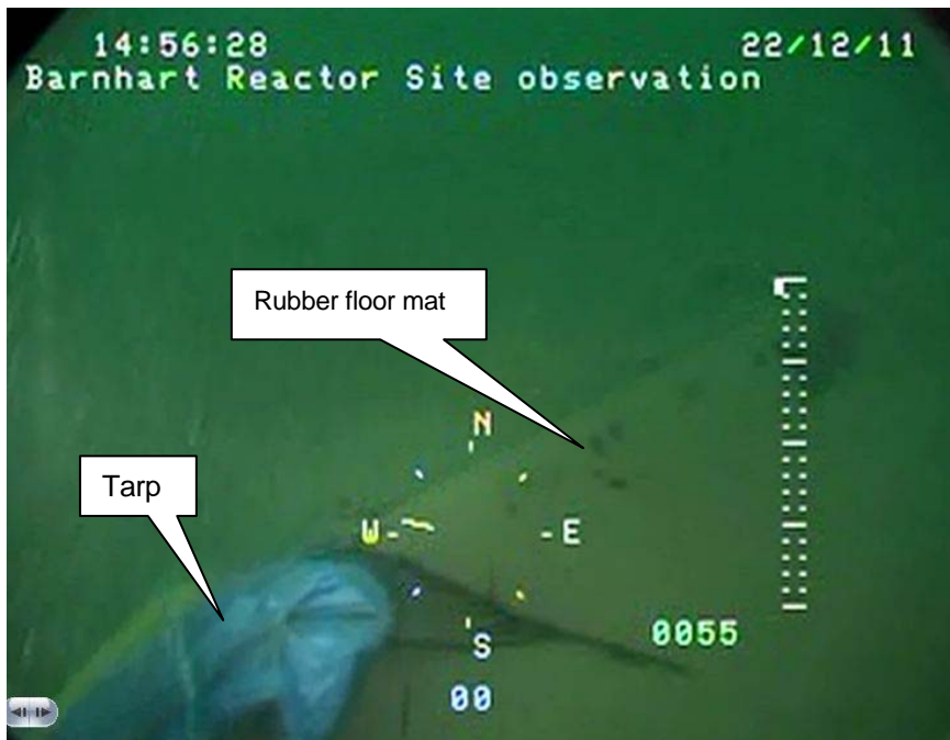
Figure 9. Incident Debris near the Reactor Vessel Impact Hole