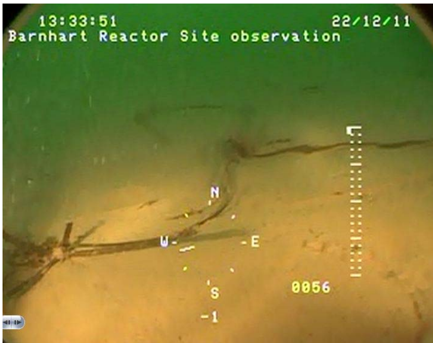
Figure 2. Unattached Plant Debris on Soft Mud near the Impact Point