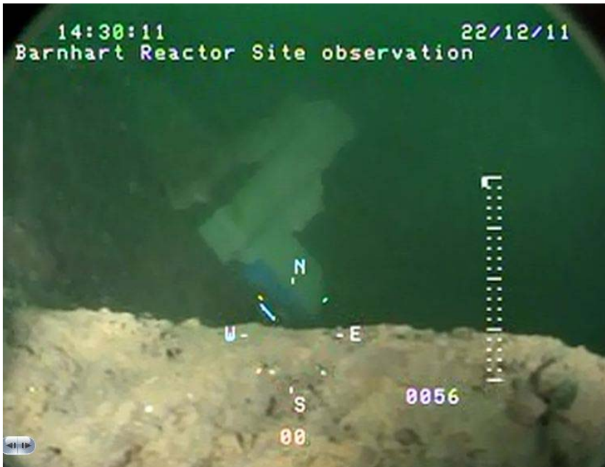
Figure 8. Plastic Debris in Reactor Vessel Impact Hole with Edge of Hole in Foreground