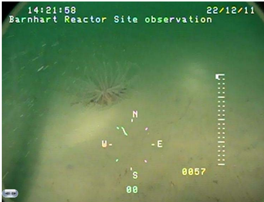
Figure 3. Burrowing Anemone in Undisturbed Mud near the Impact Point