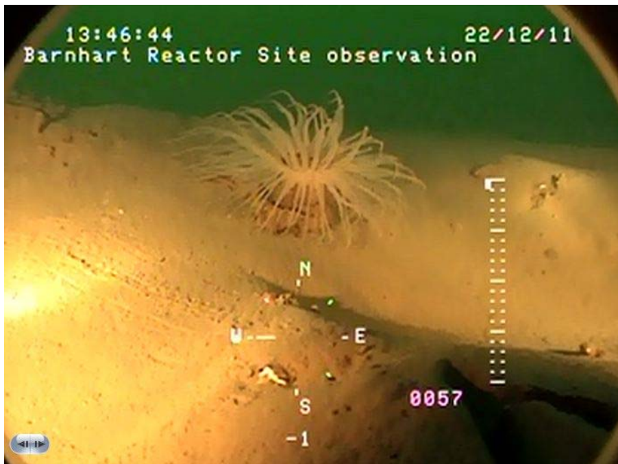
Figure 4. Burrowing Anemone with Epifauna Tracks on Previously Disturbed Mud