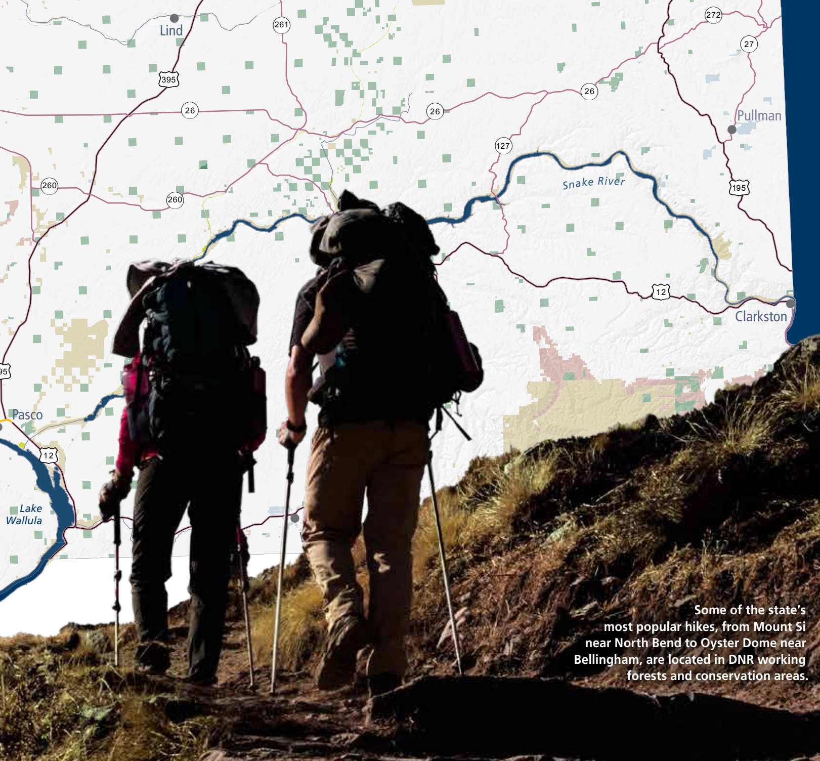
Some of the state's most popular hikes, from Mount Si near North Bend to Oyster Dome near Bellingham, are located in DNR working forests and conservation areas.