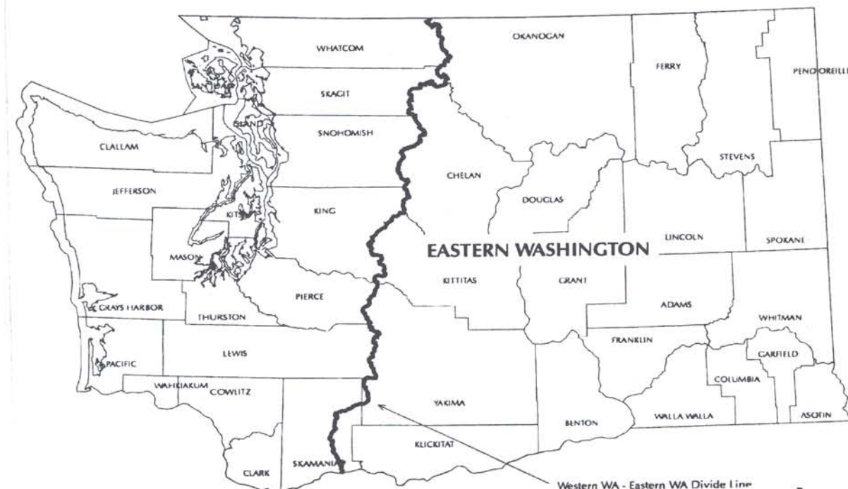
Eastern Washington Definition Map

"Eastern Washington timber habitat types" means elevation ranges associated with tree species assigned for the purpose of riparian management according to the following: