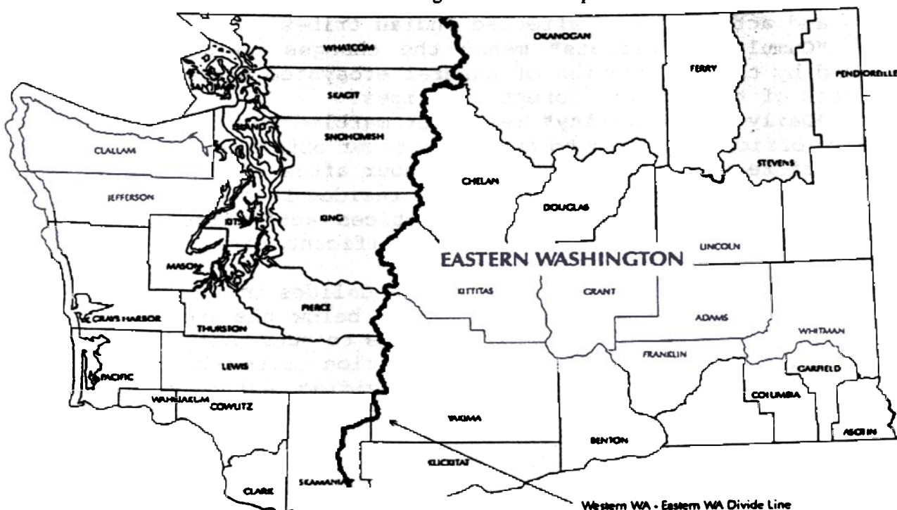
Eastern Washington Definition Map

"Eastern Washington timber habitat types" means elevation ranges associated with tree species assigned for the purpose of riparian management according to the following: