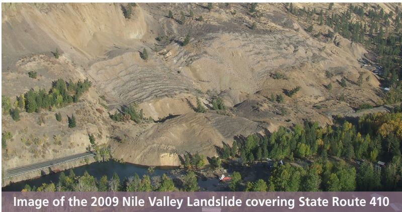
Image of the 2009 Nile Valley Landslide covering State Route 410

A landslide is a downhill movement of rock, soil, or debris. Alluvial fans and rockfalls are also landslides. Hundreds to thousands of landslides occur each year in Washington State, and they can be devastating when they occur, potentially impacting people, property, and infrastructure. Understanding these hazards and where they are located is critical to minimizing risk and mitigating impacts.