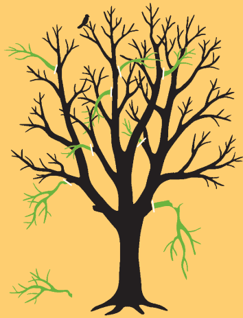
▲ Trees properly sited only need pruning to maintain tree structure, form, health and appearance.

For more information about tree selection, planting, care and maintenance, contact the city forester in your community, DNR's Urban and Community Forestry program at dnr.wa.gov , or visit treesaregood.org