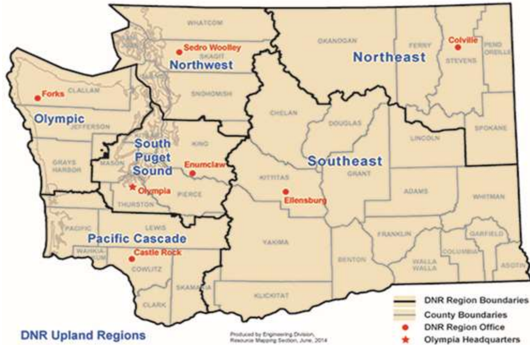
Map of DNR Regions and Offices