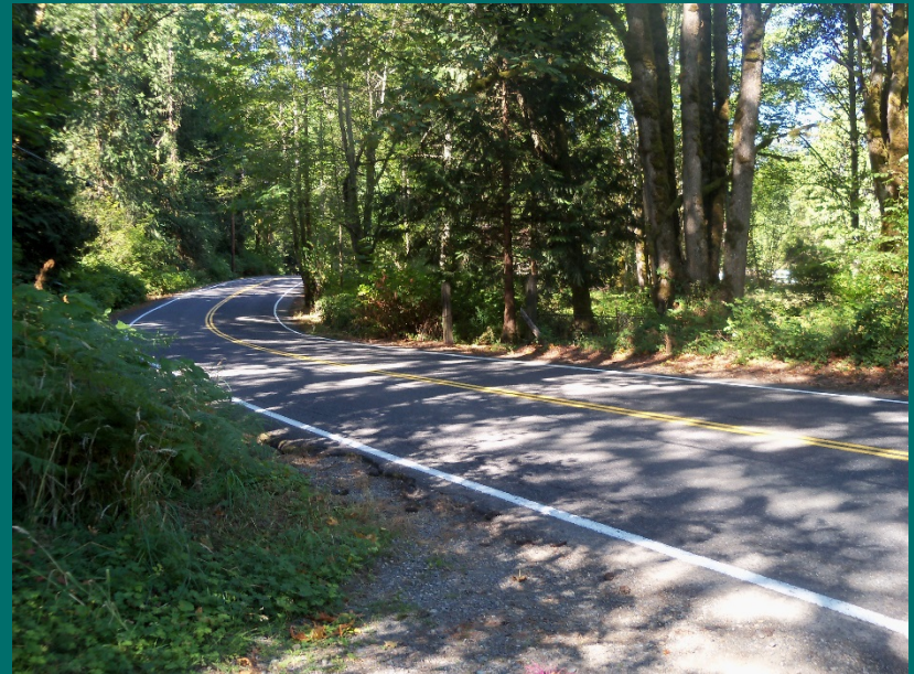
View of county road from property boundary (looking southwest)