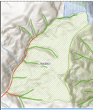
Fig 2 Map of the backup site, FPA 2940863 . This backup site was provided by the landowner in January 2024 and has not yet been evaluated in the field.